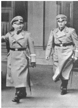
HIMMLER AND HEYDRICH

With that day, the black years began for the two brothers. Gregor was at first allowed to feel secure in his chemical works in Berlin. He had left the Party and took no part in politics. But Hitler still saw in him a dangerous rival, particularly in the stormy first half of 1934, when dissatisfaction with the achievements, or lack of achievements, of the Hitler Party was rife, and the ghost of that old coalition of Strasser National-Socialists, Reichswehr Generals, and Socialist workers, popped its head up again. For that reason, General Schleicher, and his wife, were shot in their quiet flat in a pleasant suburb. For that reason, Gregor Strasser was dragged away from his midday meal with his family and taken to the Secret Police headquarters.