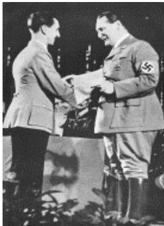
GOEBBELS AND GÖERING

The sympathy which this type of man can claim, and usually enjoy, as a Jew, puts him among the most dangerous of Gestapo agents. Strasser, strangely, bears him no mortal illwill. But Strasser's hatreds are not quite clear to me. Although his war is against Hitler, his personal hatred is less for Hitler than for Göring, whom he regards as the murderer of his brother; Heydrich, the blond assistant of Heinrich Himmler, whom he believes to have been the actual gunman; and Goebbels in whom he sees the traitor who was chiefly responsible for the defeat of the Strassers in the struggle for the soul of the National Socialist Party.