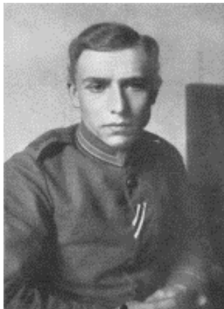
OTTO STRASSER AS A NON-COMMISIONED OFFICER, 1915

Here you have, also, a good picture of Otto Strasser, for the two brothers were much alike. But for intrigues and stiletto-work that outdid the medieval Italian courts and the gang-wars of Chicago, the Strassers, and not Hitler, might have become the leaders of Germany. Germany would then never have known the orgasms of hysterical, mock-patriotic self-pity and self-applause which she knew under Hitler; but she and Europe would probably have been spared war. The time may be coming soon for Otto Strasser to take up his brother's work.