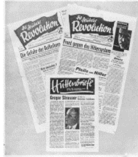
THREE SPECIMENS OF THE MINIATURE ANTI-HITLERIST NEWSPAPERS PRINTED ON FLIMSY PAPER BY OTTO STRASSER AND SMUGGLED INTO GERMANY FROM AUSTRIA, CZECHOSLOVAKIA AND DENMARK

describe later. Some of them are of much interest, and I wonder that none has yet been translated into English. All this time, the production of miniature anti-Hitlerist newspapers, of pamphlets and letters, was going on apace. From Czechoslovakia, as from Austria, they were smuggled in large quantities into the Reich, by reckless men who used the most audacious methods, who continually risked, and on several occasions lost their lives, for no other payment than the hope of contributing to the end of Hitler.